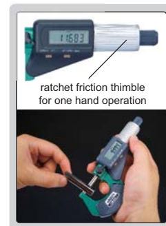
ratchet friction thimble for one hand operation